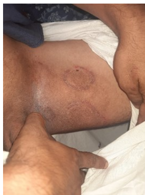
Image 2: Lesions that appeared following abrupt stoppage of treatment