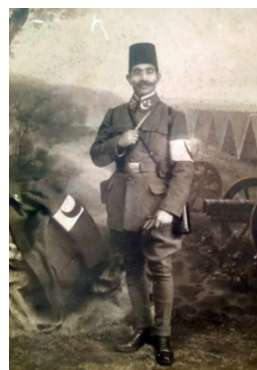
Mukhtar Ahmed Ansari

Apart from his political work, Ansari was a dedicated educator and humanitarian. He was a principal founder and long-serving Chancellor of Jamia Millia Islamia University and contributed to the establishment of Kashi Vidyapeeth in Varanasi. He balanced these public duties with his medical practice, treating all patients with equal compassion and authoring a significant medical text. His residence in Delhi, Dar-us-Salam, was a nerve center for the Congress and often hosted Mahatma Gandhi. Ansari died in 1936, remembered as a unifying patriot, a healer, and an educational pioneer.